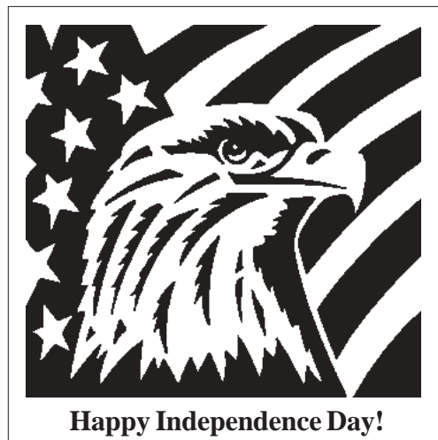
Happy Independence Day!